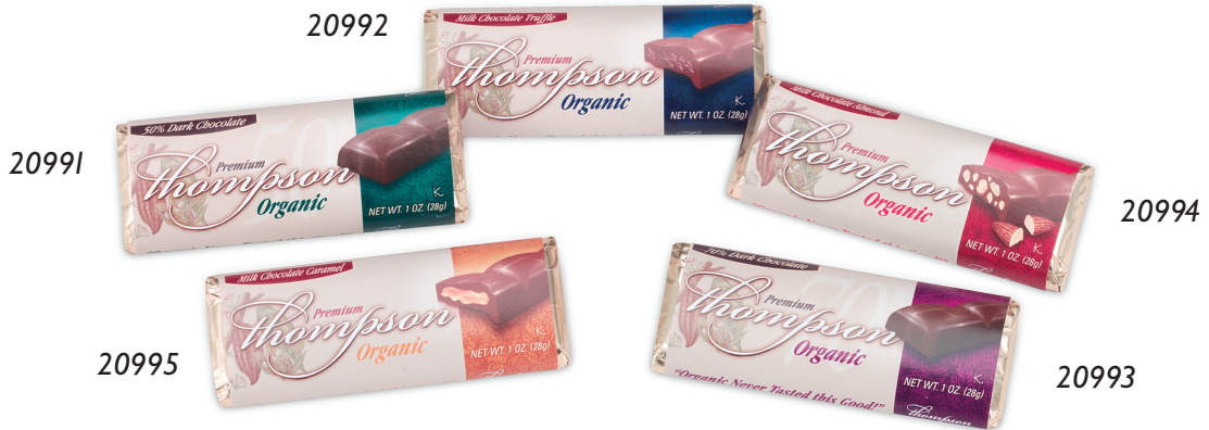
20991 50% Cocoa Dark Bar, 1oz. 20992 Milk Truffle Bar, 1oz. 20993 70% Cocoa Dark Bar, 1oz. 20994 Milk Almond Bar, 1oz. 20995 Milk Caramel Bar, 1oz.