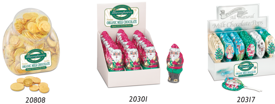
20808 Chanukah Gelt - Mesh Bag, 1oz. 20301 Flat Santa in Display, 1oz. 20317 Christmas Pops in Display, .5oz.