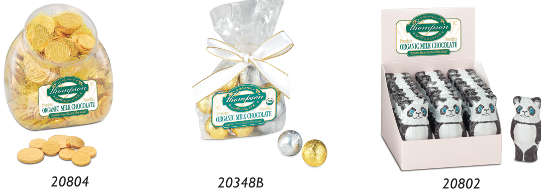
20804 Gold Coins - Mesh Bag, 1oz. 20348B Gold & Silver Balls in Gift Bag, 3oz. 20802 Flat Pandas in Display, 1oz.